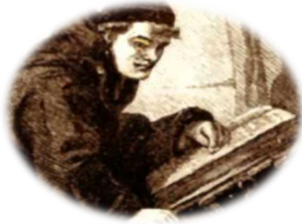
BROTHER LAWRENCE (1611 - 1691)

"The Practice of The Presence of God" describes Brother Lawrence's philosophy that a relationship with God is more important than the service and work done in God's name. Brother Lawrence focuses on seeing the love of God, his presence, in all aspects of daily life. This simple, yet profound teaching will empower you to seek the joy of God's presence in the midst of every moment and circumstance.